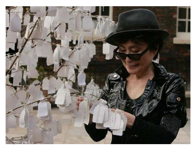
Yoko Ono reading some of the peace messages during a public event.